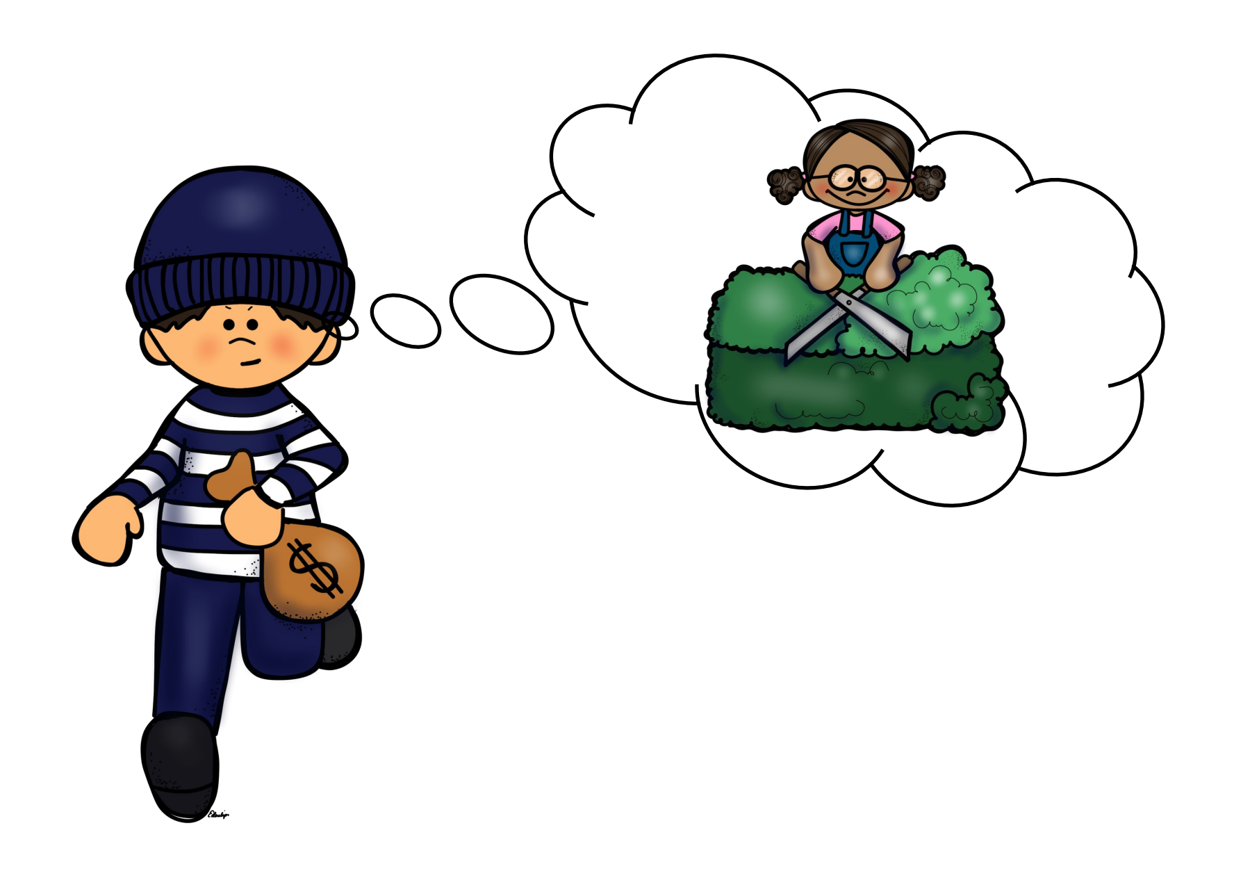
She says, "Lop, thief! Lop!"