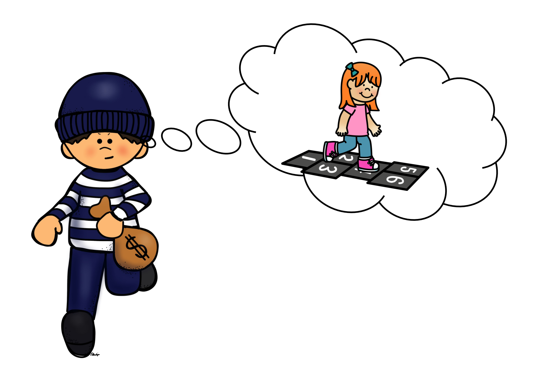
She says, "Hop, thief! Hop!"