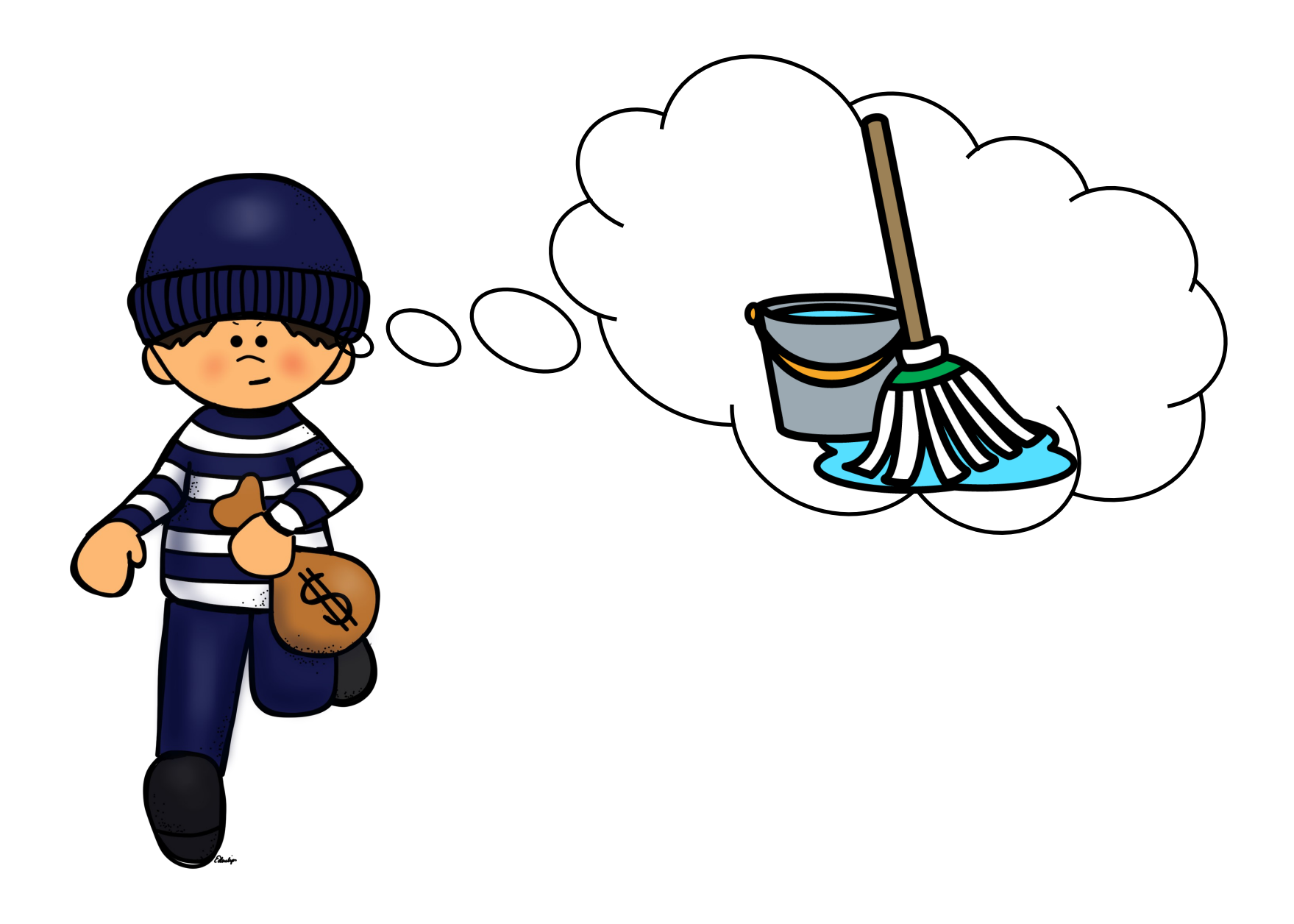
She says, "Mop, thief! Mop!"