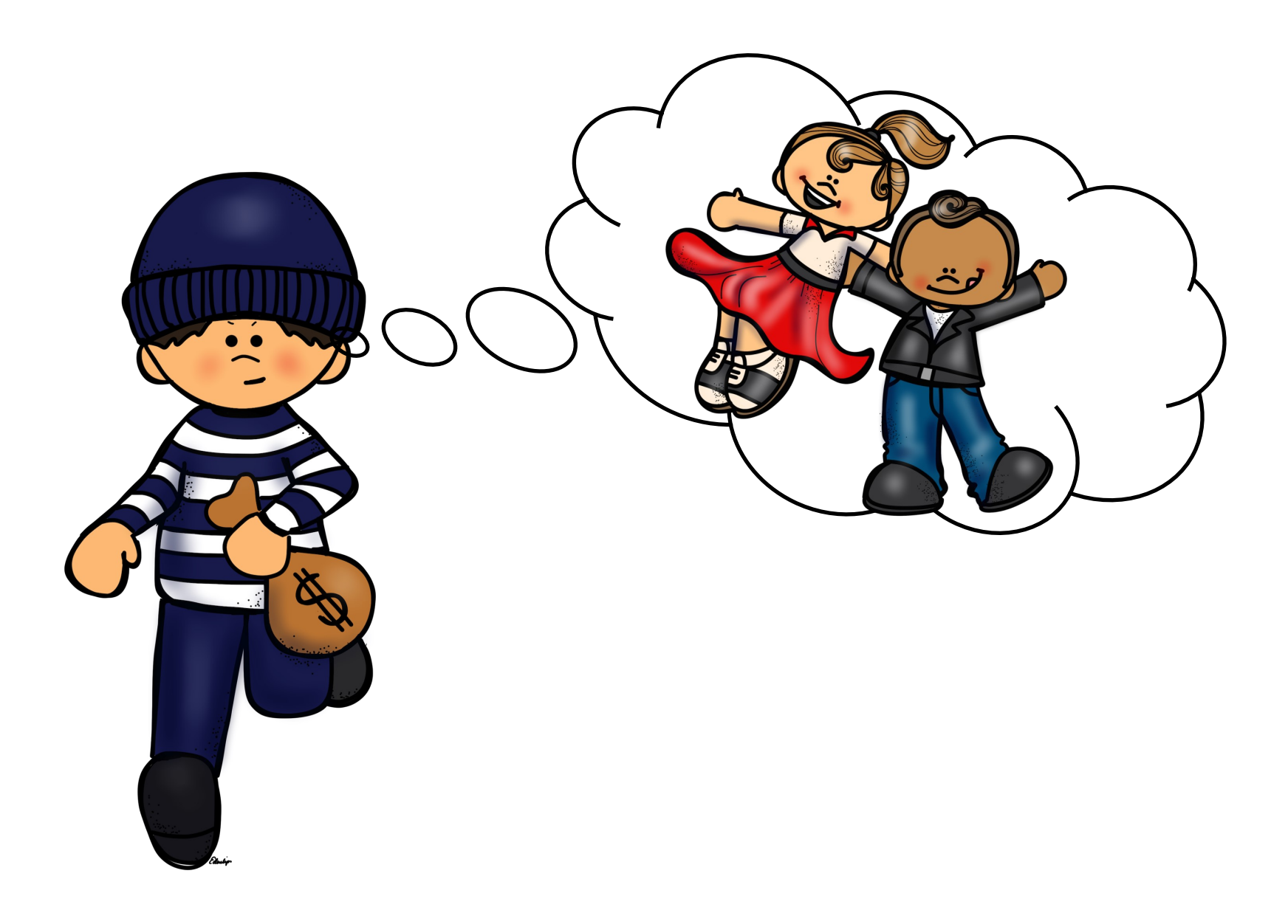
She says, "Bop, thief! Bop!"