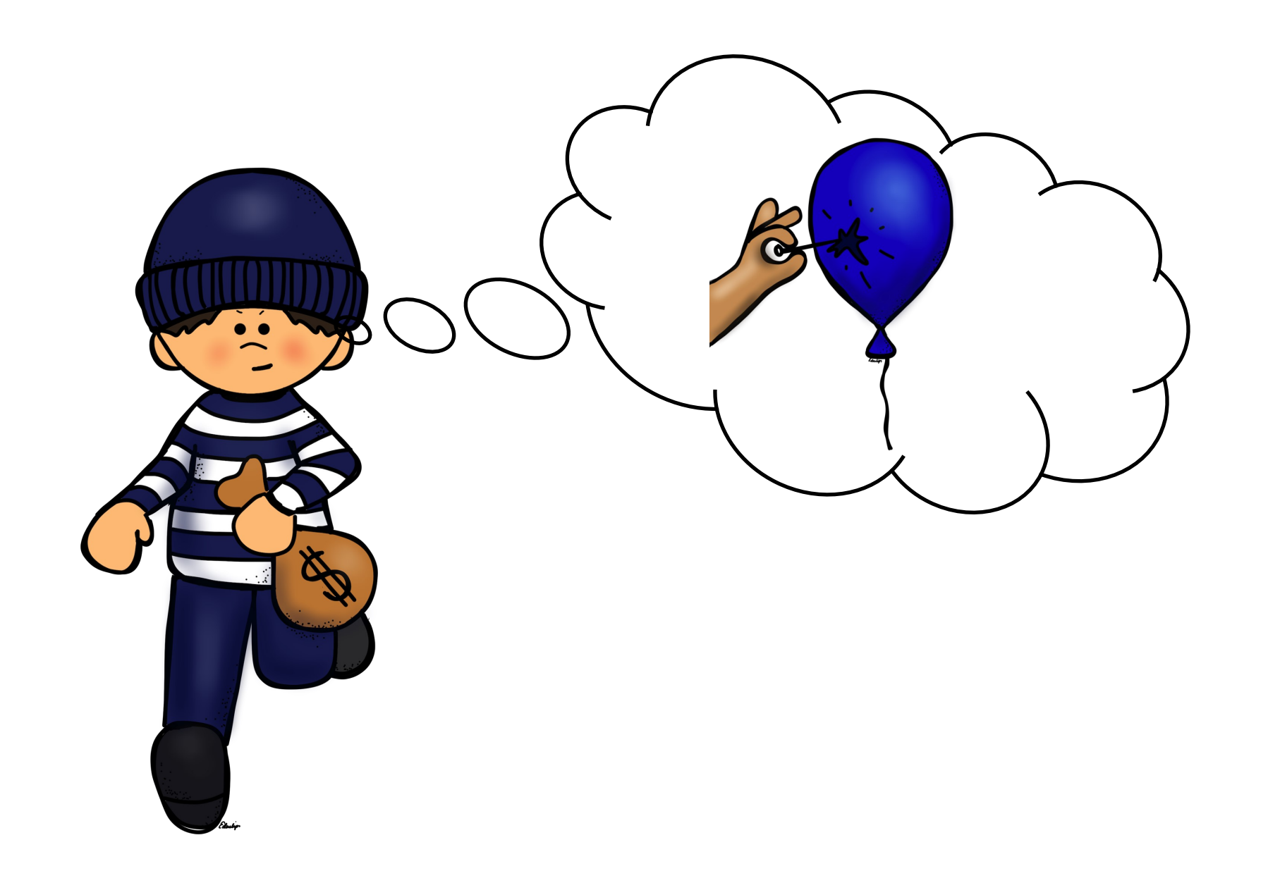
She says, "Pop, thief! Pop!"